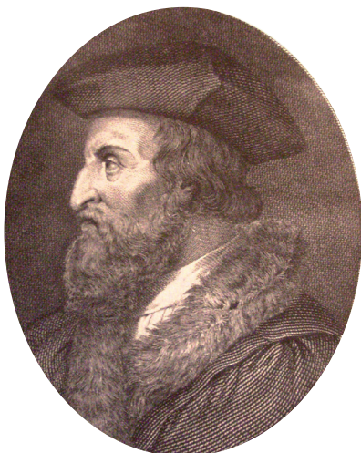
Figure 1: Girolamo Fracastoro. Image in the public domain.

The first endoscopes were not long or powerful enough to clearly visualise the